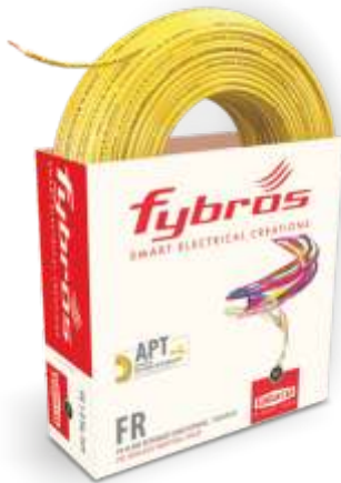
FR-FLAME RETARDANT PVC INSULATED SINGLE CORE UNSHEATHED INDUSTRIAL CABLE (MULTISTRAND)