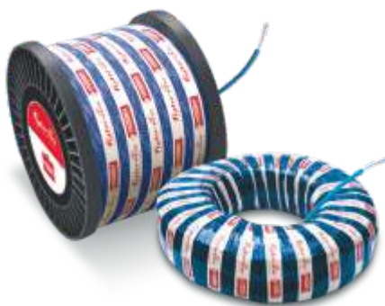
PVC INSULATED SINGLE CORE UN-SHEATHED STRANDED ALUMINIUM WIRE