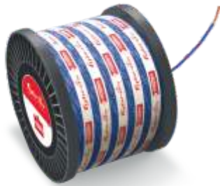
PVC INSULATED SINGLE CORE UN-SHEATHED STRANDED COPPER WIRE