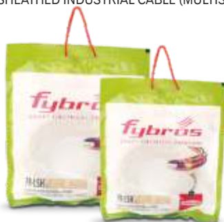
FR-LSH - 180 mtrs. (Double Coil) Special project packing on request