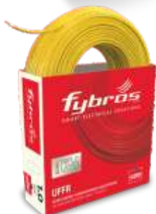
UFFR- ULTRA FLEXIBLE FLAME RETARDANT INSULATED SINGLE CORE UNSHEATHED INDUSTRIAL CABLES (MULTISTRAND)