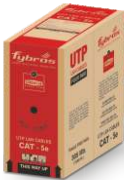
NETWORKING LAN CABLES

Packing : Supplied in 100 mtr. & 300 mtr. in attractive carton, longer length available on request.