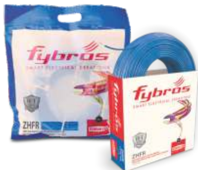
ZHFR - ZERO HALOGEN FLAME RETARDANT INSULATED SINGLE CORE UNSHEATHED INDUSTRIAL CABLES (MULTISTRAND)