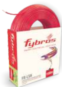
FR-LSH - FLAME RETARDANT LOW SMOKE AND HALOGEN PVC INSULATED SINGLE CORE UNSHEATHED INDUSTRIAL CABLE (MULTISTRAND)