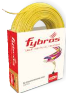
PVC INSULATED SINGLE CORE UN-SHEATHED SOLID/STRANDED COPPER WIRE

XTRA GARD - (FR-LSH) MULTI STRAND SINGLE CORE UNSHEATHED FLEXIBLE INDUSTRIAL CABLES IN VOLTAGE GRADE UPTO AND INCLUDING 1100 VOLTS 90 mtrs.