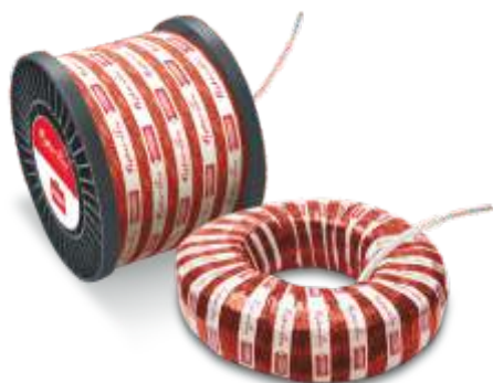
PVC INSULATED SINGLE CORE SHEATHED STRANDED ALUMINIUM WIRE