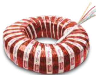
CCTV CAMERA CABLES

Packing : Supplied in 305 mtr. in Box Packing, longer length available on request..