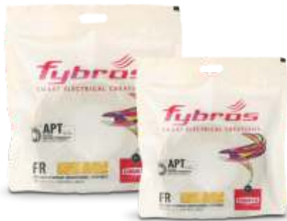
FR - 180 mtrs. (Double Coil) Special project packing on request