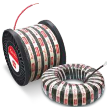
PVC INSULATED SINGLE CORE SHEATHED STRANDED ALUMINIUM WIRE