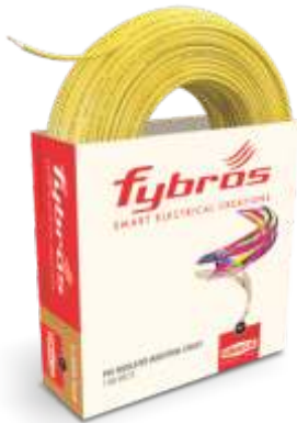
PVC INSULATED SINGLE CORE SHEATHED STRANDED COPPER WIRE

Packing : Supplied in PP Reel/Drum Packing.